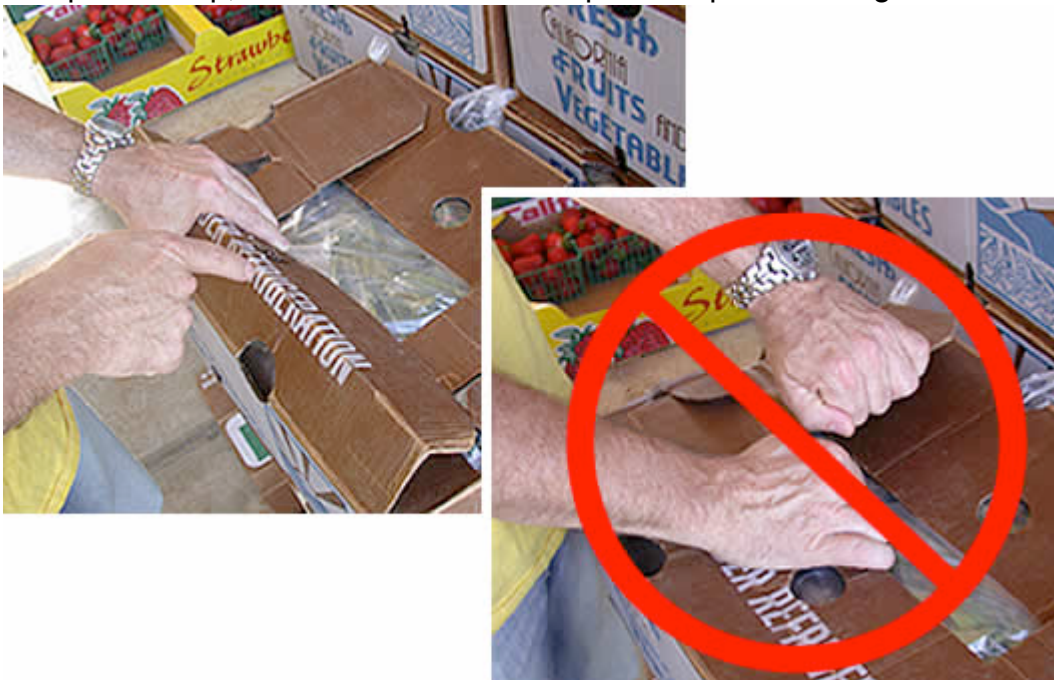
Do not pull or tear at flaps!

To open the top, look for crease in the flap then squeeze along that crease to 'unlock'.